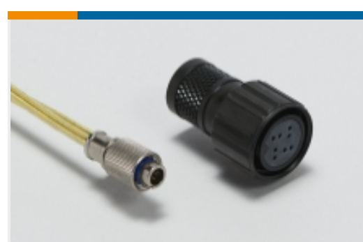
Standard Circular Connectors(519)